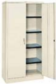
STEEL STORAGE CABINET 36"W X 18"D X 72"H

http://www.fecoi.com/mm5/merchant.mvc?Screen=CTGY&Store_Code=FEC&Category_Code=STGCAB-STD